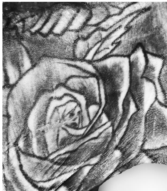
A portion of the flower/plant tattoos on the decedent's lower left arm.

If you recognize or believe you may be able to help identify the deceased, contact the Harris County Institute of Forensic Sciences at either number provided: